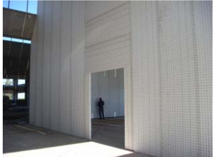
Tebo Industrial Plant

The same building approach, used in Ozzano and San Lazzaro for residential and industrial buildings, is applicable for any kind of public and private buildings.