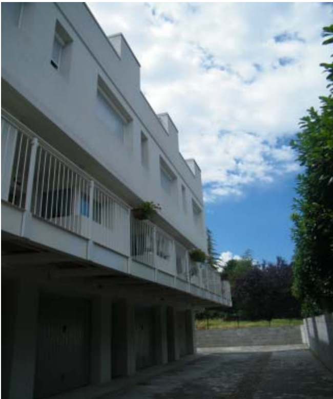
2LHouse in Ozzano dell Emilia, affordable to be sustainable

Exploring new processes, new methodologies, new use of materials and elements whilst using everyday materials and simple technologies that anyone can afford; this was the basis for the development of the new building approach of the Ozzano dell'Emilia complex.